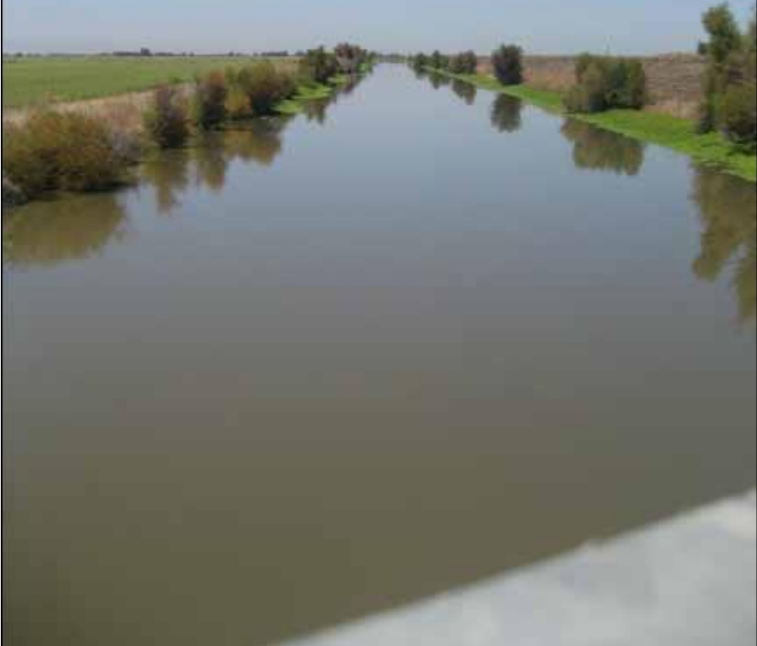
Colusa Basin Drain at Knights Landing